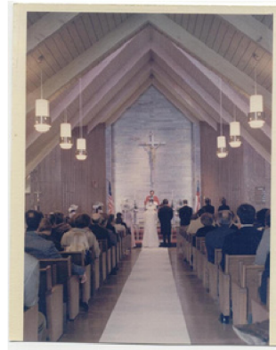
A wedding with the interior of St. Thomas the Apostle pictured. Date unknown.